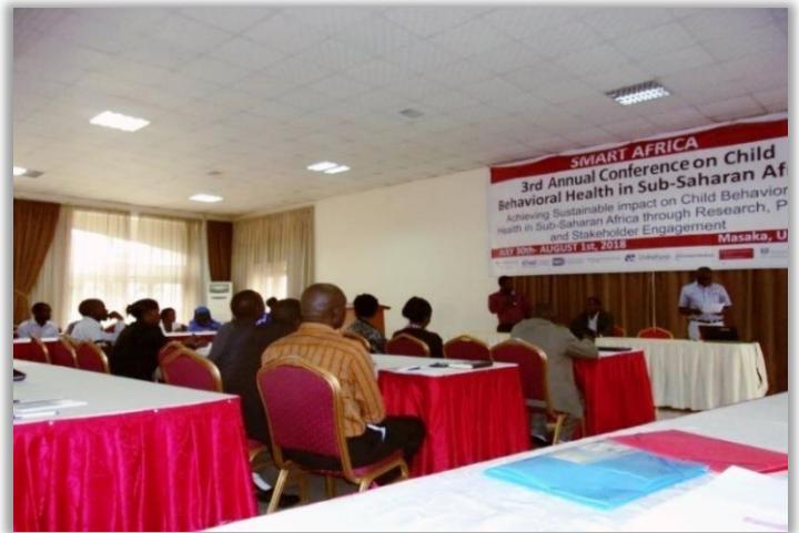
Welcoming remarks at the Suubi+Adherence closeout meeting