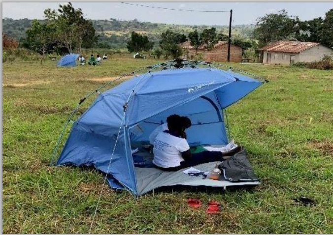
Suubi4Her field interviews in progress