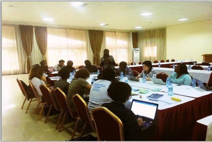
The SMART Africa Kenya and Ghana Team Meeting

The 3 rd day of the conference was specific to SMART Africa colleagues, and allowed for teams to consider and plan their own study implementation as well as troubleshoot current or anticipated challenges under the guidance of the Ugandan team leaders.