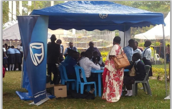
Student participants of the Suubi4Her study opening savings accounts