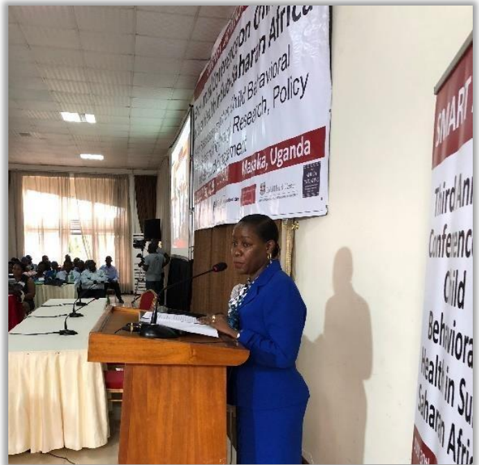
Hon. Florence Nakiwala Kiyangi presenting to conference attendees

Against this backdrop, the Honorable Minister called upon local governments in the region, NGOs, researchers and academics to invest in children and youth programs and policies, including ones explicitly focused on behavioral health to ensure healthy development of young people, and their contribution to the demographic dividend and overall economic growth and development.