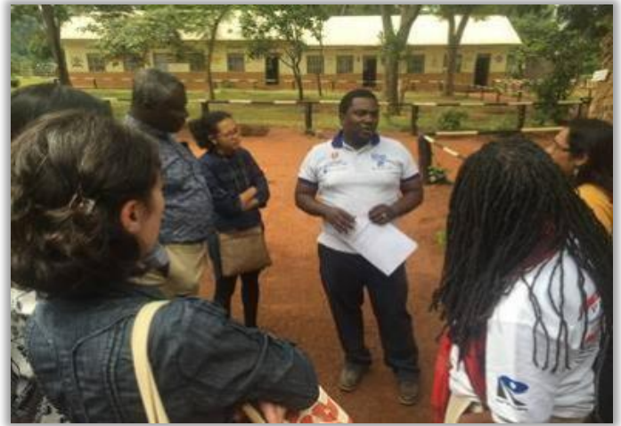
The SMART Africa Kenya and Ghana teams' discussion after their observation of a multiple family group training session in the field