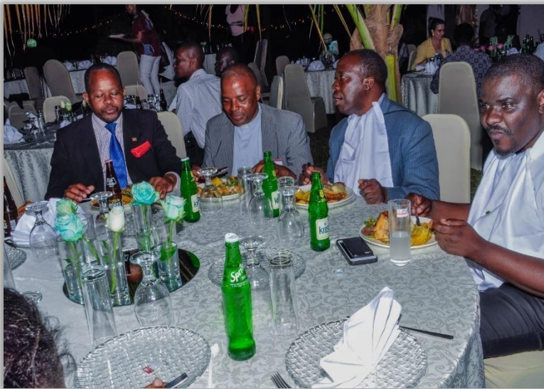
Conference attendees enjoy a light meal during the cocktail dinner organized by SMART Africa and ICHAD

The 1 st day of the conference concluded with a cocktail dinner organized by the SMART Africa and ICHAD. The dinner offered the opportunity for over 250 attendees to professionally interact, exchange notes, make new connections, and for SMART and ICHAD to thank the community collaborators for their investment in the two projects over the years.