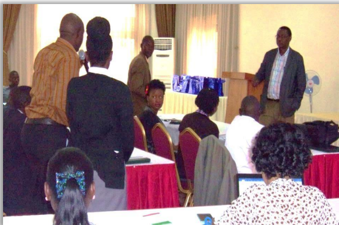
Question and answer session at the closeout meeting

using combination interventions to address issues of poverty among HIV/AIDS impacted communities in Sub-Saharan Africa. He explained some of the factors that hinder HIV positive children from adhering to their medication such as food shortages and the fear of being stigmatized by neighbors when travelling long distances to health centers.