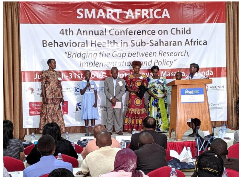
A participant from the SMART Africa-Uganda study sharing her experiences from the Multiple Family Group intervention

Conference attendees also heard from study stakeholders including a community healthcare worker, two parent peers and child representatives. The stakeholders talked about the impact of the study on them as individuals, their families and their communities at large. They were grateful to the SMART Africa team for doing this important work in their communities, and urged the team to continue supporting child mental health.