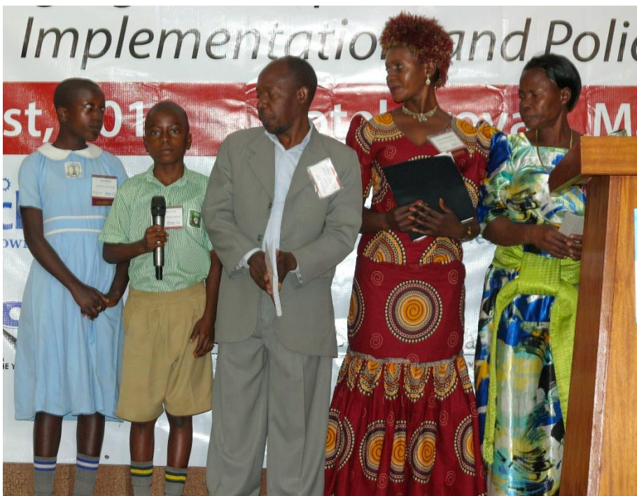
A participant from the SMART Africa-Uganda study sharing his experiences from the Multiple Family Group intervention

“The sessions have had an effect in regards to how I relate with my child. Communication gaps have been filled and I am happy with how things are going with my child. I consult with or seek my child’s opinion about everything I do at home these days.”