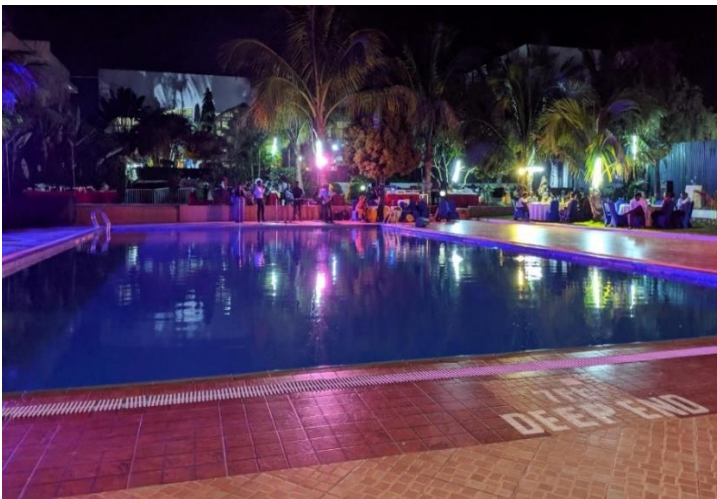
The conference dinner set-up at the Hotel Brovad