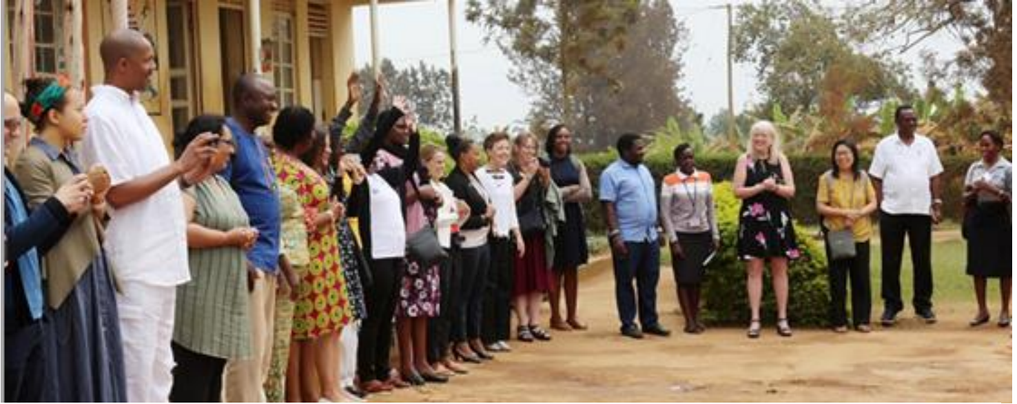
Conference attendees being welcomed by a local school participating in the SMART Africa-Uganda Study

On the third day of the conference, participants visited project field sites including schools, health clinics, and a fishing village. At the schools, participants observed MFG sessions in action; clinic attendees saw HIV care and treatment facilities; and those who went to Kasensero fishing village observed the delivery of the HIV risk reduction sessions for women engaged in sex work, as part of ICHAD's Kyaterekera Project. According to the participants' feedback, these visits were powerful and impactful for all.