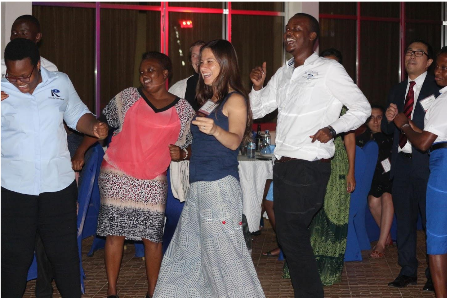
SMART Africa and ICHAD staff and affiliates join in on the fun at the cocktail party