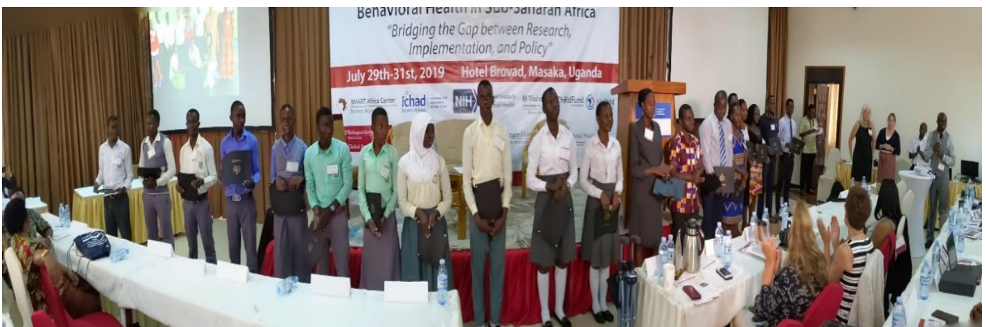
The 2019 Junior Travel Awardees pose for a photo after receiving their certificates. Awardees came from 9 different schools in Uganda

This conference marked the second installment of the junior scholars' conference travel award program. 20 junior scholars were selected from a pool of over 80 applicants, including 12 high school students and 8 university students from a total of 9 different Ugandan schools. Through this annual program, SMART Africa and ICHAD intend to generate interest in child behavioral health and research among high school and college students, and further strengthen the pipeline of child behavioral health researchers and practitioners in Sub-Saharan Africa. Following the Junior Scholar panel discussion, the 20 Junior Scholar Travel Award Recipients were awarded certificates by Dean Mary McKay from Washington University in St. Louis and Drs. Pringle and Campbell-Rosen from the NIMH recognizing their achievements.