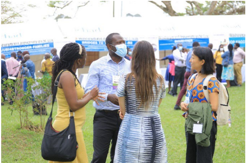
Trainees, alumni, mentors, and program staff, gather at the Kimaanya Catholic Church grounds in Masaka City, Uganda

These days featured a comprehensive training schedule for our trainees through engaging and prolific researchers in the field. Program faculty mentors and field experts facilitated sessions on qualitative research methods, big data, dissemination and implementation science, cost-effectiveness research, research tools and measurements, scientific integrity and ethical conduct of research, as well as budget development and justification for research projects. Beyond the didactic sessions, this time facilitated crucial in-person networking opportunities and featured presentations of our first graduating cohort of CHILD-GRF Fellows.